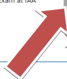
Image Ad - $100/month

Chat with IAA! Member forum Job bank in our career center