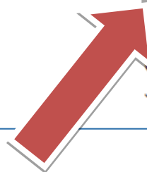
Image Ad - $100/month

What with IAA! Member forum Job bank in our career center