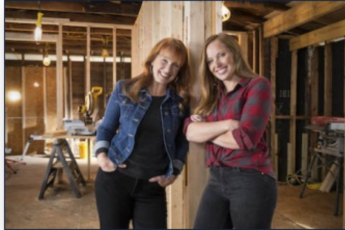
KAREN LAINE & MINA STARSIAK

Mother and daughter duo Karen Laine and Mina Starsiak are setting out to revitalize their hometown of Indianapolis one property at a time. They're buying up run down homes and transforming them into stunning urban remodels. With Mina's real estate know-how and Karen's no-nonsense legal background, these ladies are unstoppable in getting a property they want and enlisting their family's help with demo and construction. When it comes to exciting new homes in the city of Indianapolis, it all comes down to Two Chicks and a Hammer. Mina and Karen star in the new HGTV series, Good Bones .